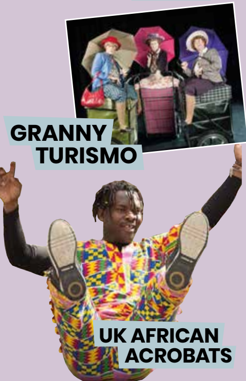
UK AFRICAN ACROBATS