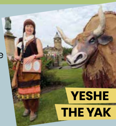
YESHE THE YAK

Xena Flame Hula Hooping funtime for everyone! Xena will be performing in Hailsham and Uckfield .